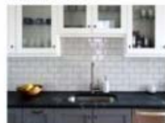
Dan's Kitchen: The Big Reveal