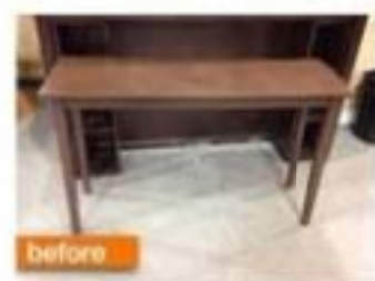
Before & After: A Thrifted Table Gets More Glam