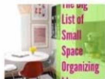
The Big List of Small Space Organizing Ideas & Inspirations